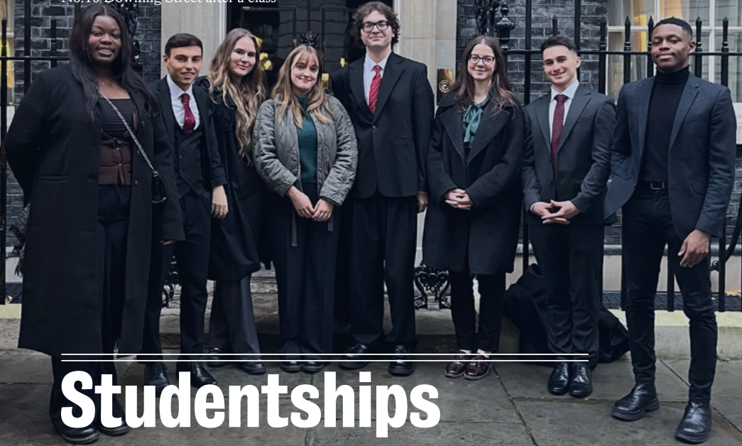
Strand Group studentship holders outside No.10 Downing Street after a class