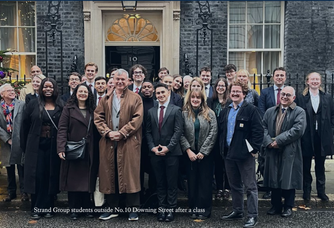
Strand Group students outside No.10 Downing Street after a class