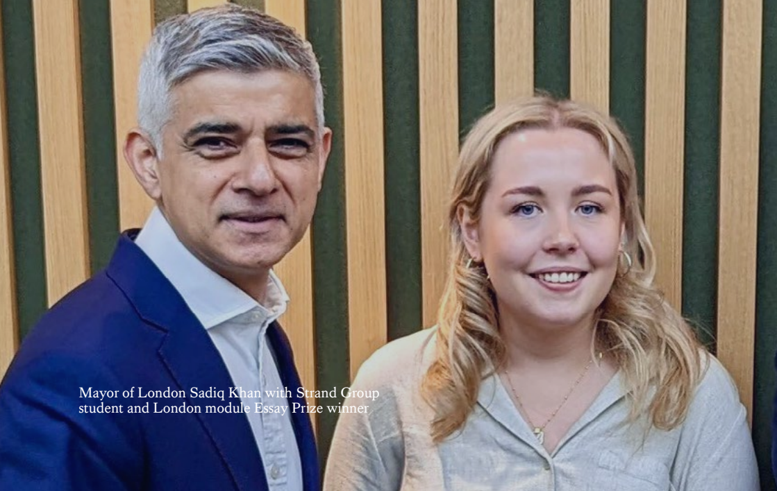
Mayor of London Sadiq Khan with Strand Group student and London module Essay Prize winner