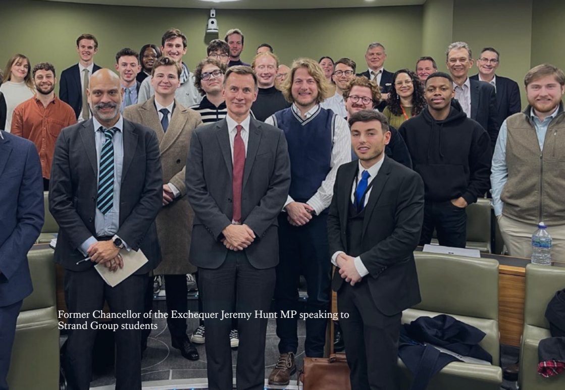
Former Chancellor of the Exchequer Jeremy Hunt MP speaking to Strand Group students